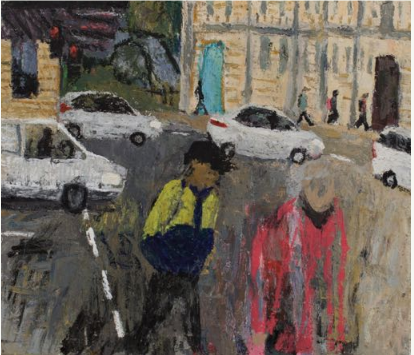
Abercrombie / Lawson St Crossing