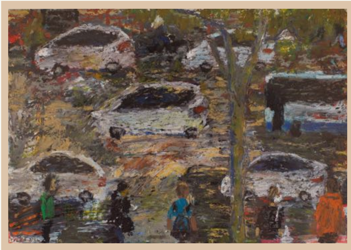
Waiting for Bus