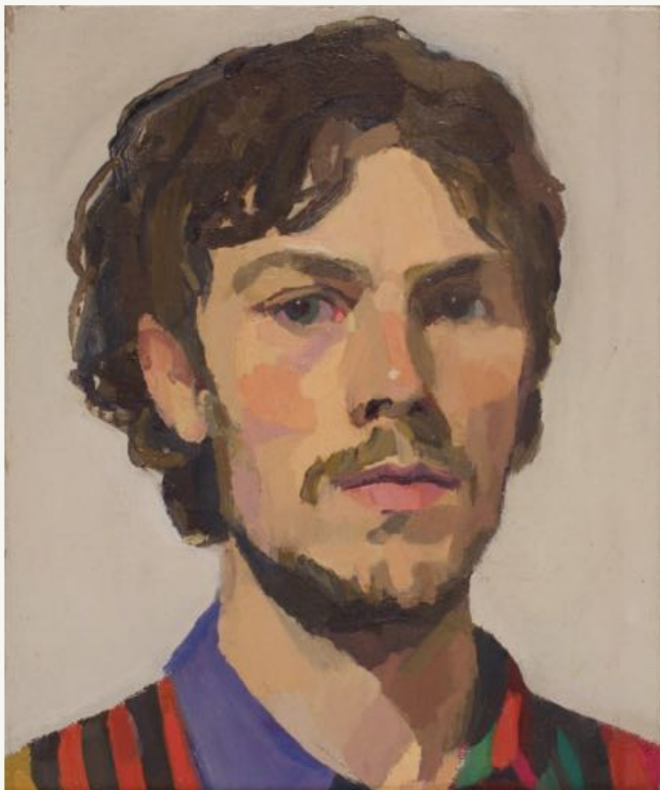
Self Portrait in coloured shirt