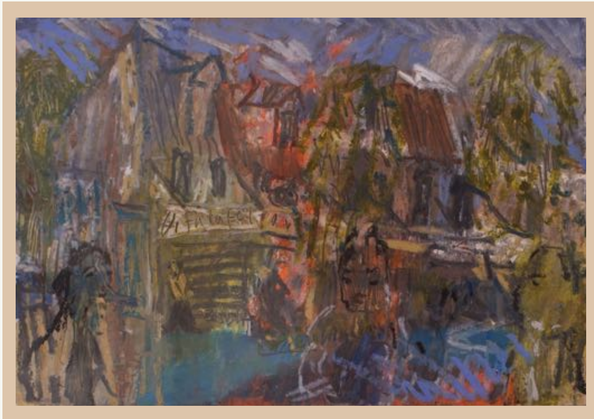
Abercrombie St Corner