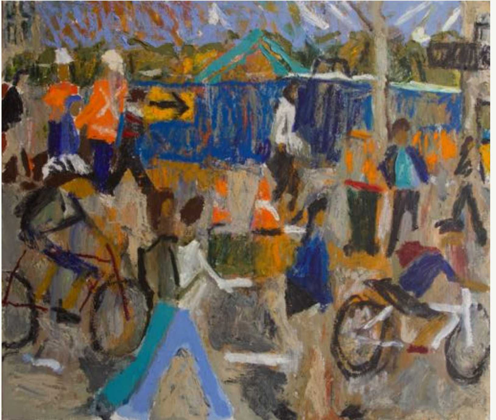
Movements in May