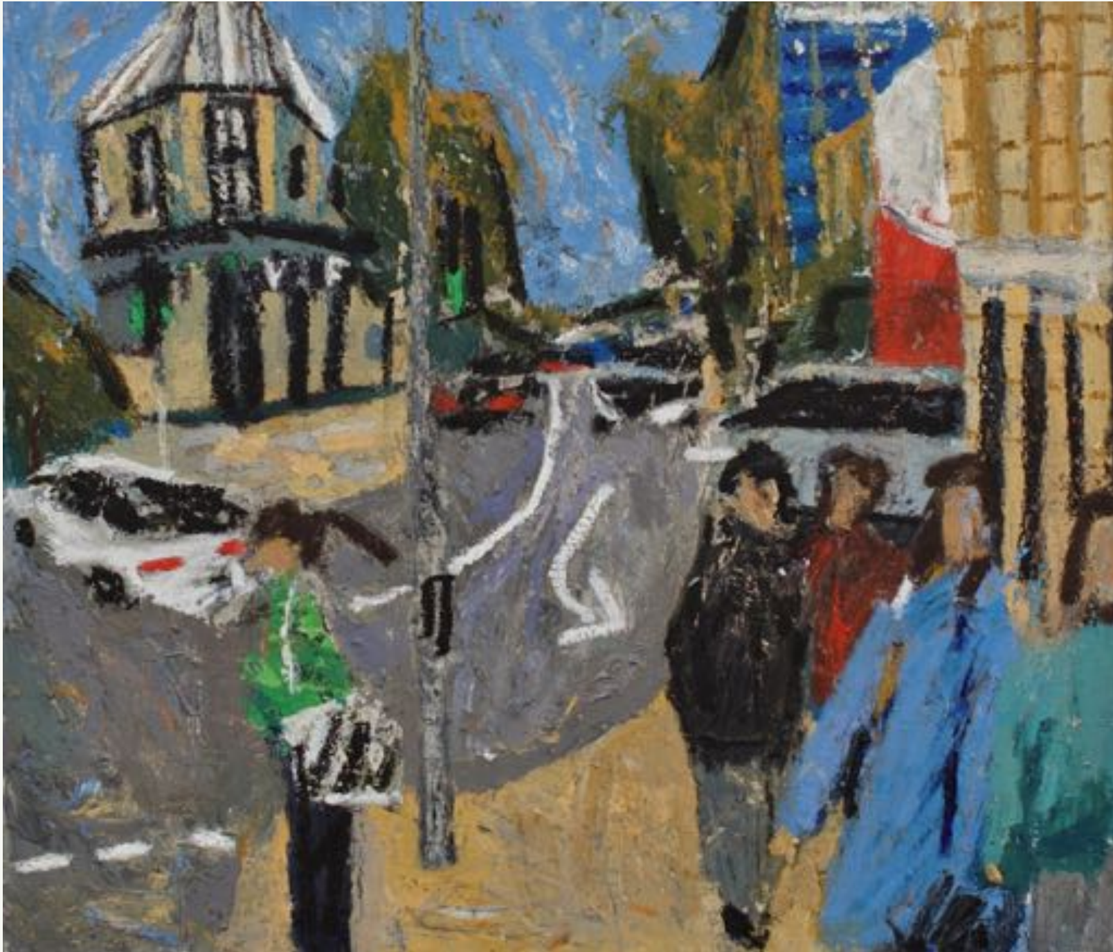
Lawson St Footpath