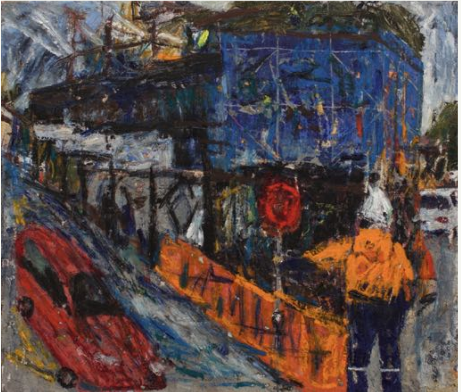
Construction Site Corner