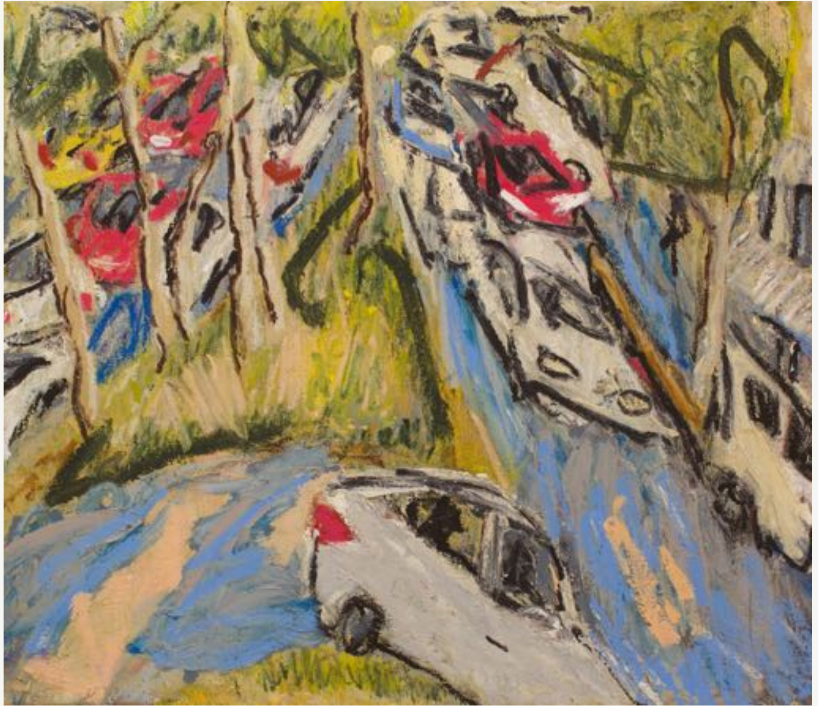
Regent St Traffic