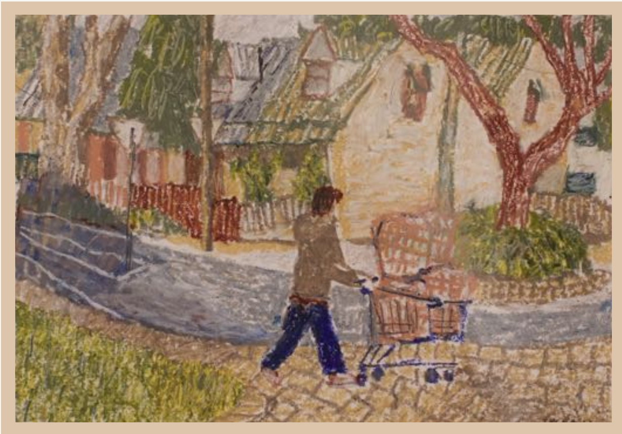
Phillip St Footpath