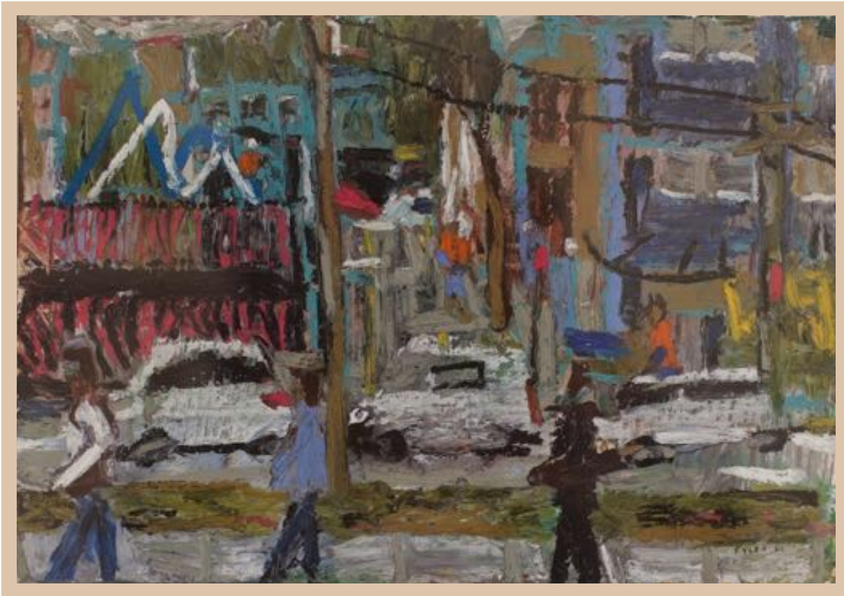
Gibbons St near Building Site