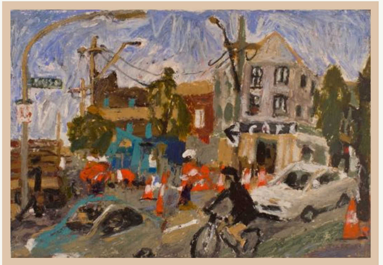
Morning on Lawson St